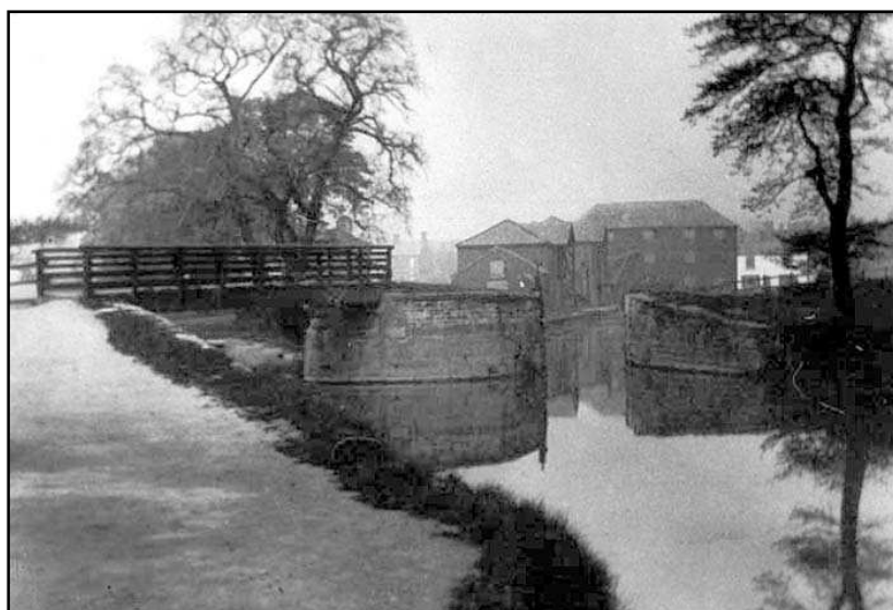
The original canal basin in Chesterfield. This was abandoned circa 1890 when the Great Central Railway was built across it. The railway was more recently replaced by the A61 Chesterfield Bypass

The Chesterfield Canal Trust reports that a formal partnership agreement has been signed to move forward a massive regeneration scheme based around the newly created water space linked to the Chesterfield Canal. A design competition is shortly to be launched, with development expected on the A61 approach into Chesterfield, and regenerating the Lavers timber yard and Trebor sites.