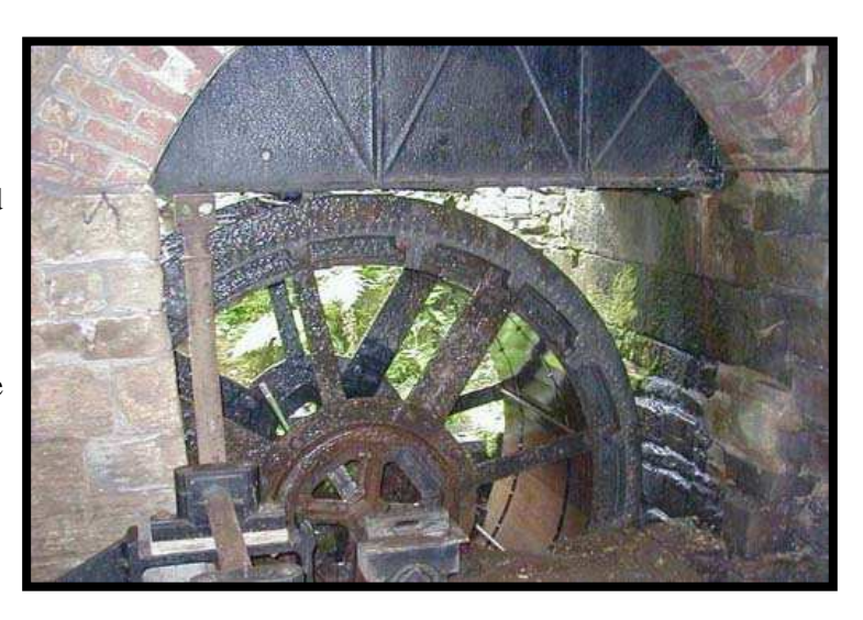
Wortley Top Forge: Blower Wheel.

Since 1953, South Yorkshire Industrial History Society has been restoring the forge and it is now the only heavy iron forge in the country to retain its original buildings, waterwheels, hammers and cranes.