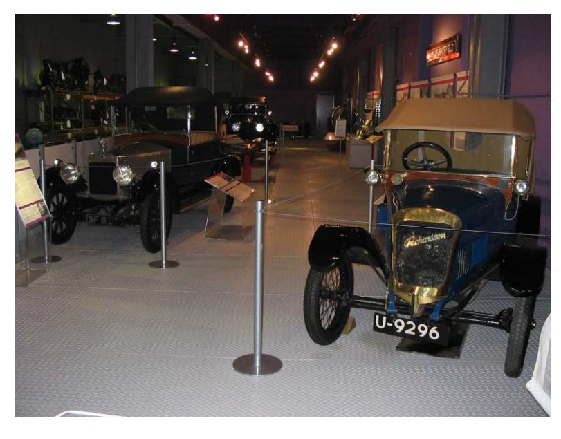
Kelham Island: the new transport gallery, with Sheffield produced Richardson cars

As part of the development, a new mezzanine floor has been built for the transport collection. The collection includes the famous Sheffield Simplex car, built in 1920. Also on display are the Charron Laycock car, Richardson Light car, Ner-a-car motorcycle and Rolls-Royce jet engine.